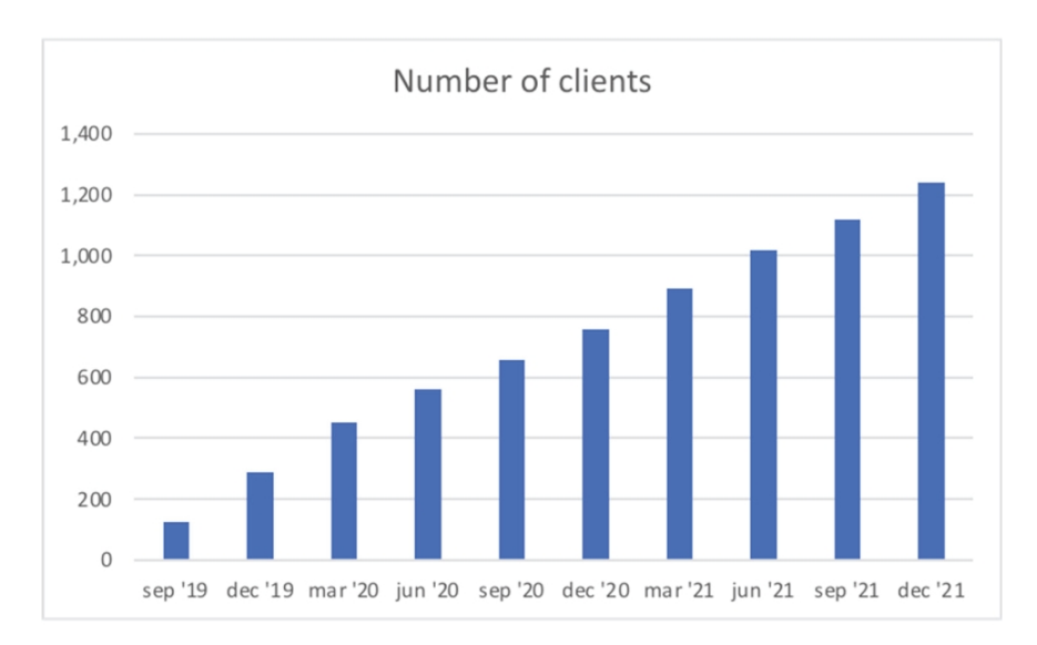
Expansion Within Existing Retailers and Brand Customers

As of today, we service approximately 1,300 retailer and brand clients with over 2,400 retail locations, which is comprised of most of the largest multi-state cannabis companies and a significant number of single-state operators. Our excellent reputation in the cannabis market and comprehensive solutions offering provide us with the opportunity to expand our footprint and grow these accounts via up-selling and cross-selling. We grow alongside our clients via a "flywheel" effect as we benefit from the growth of their businesses and expansion of their customer base, which is, in turn, enabled by their use of our platform. We have a track record of using our comprehensive product offerings and results-driven proposition to grow our relationships with clients and drive revenue.